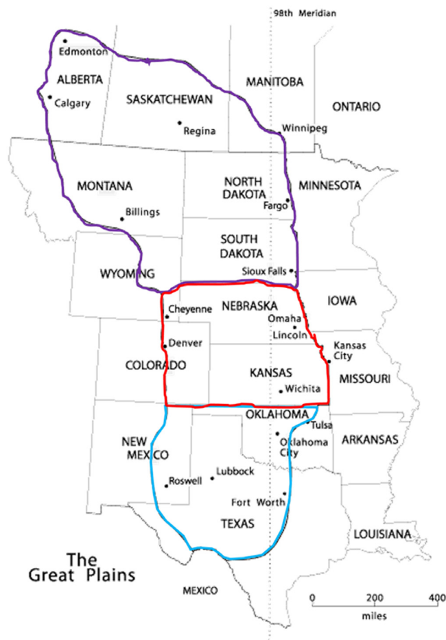
Figure 1. Map of the Great Plains showing three main regions: (1) Northern Great Plains (marked by purple line), (2) Central Great Plains (marked by red line), and (3) Southern Great Plains (marked by light blue line). Adapted from Center for Great Plains Studies, University of Nebraska–Lincoln.